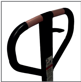
Stock Code - CT4 Machinery Handle Overlay Stick-on, easy application & removal W 95mm x H 130mm (trimmable) Pack Size: 2

PROTECTION OF STAFF AND VISITORS HAS NEVER BEEN MORE IMPORTANT THAN TODAY.