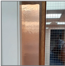
Stock Code - CT2 Door Push Plate Overlay Stick-on, easy application & removal W 95mm x H 440mm (trimmable) Pack Size: 1